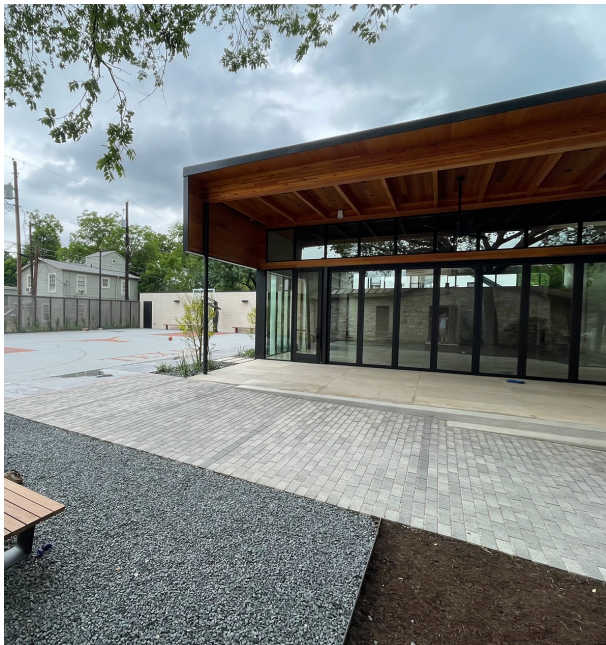
Progress picture of pavilion construction

Glazing Vision was pleased to be a part of the Texas Delt project alongside STRUCTURA Inc and Michael Hsu Office of Architecture, and we believe that the Flushglaze Eaves really drew the pavilion construction to a perfect close.